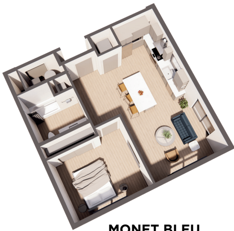
MONET BLEU 1 BED X 1 BATH 660 SF