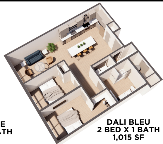
DALI BLEU 2 BED X 1 BATH 1,015 SF

*All renderings & square footages are approximations. Floor plan sizes & finishes may vary.