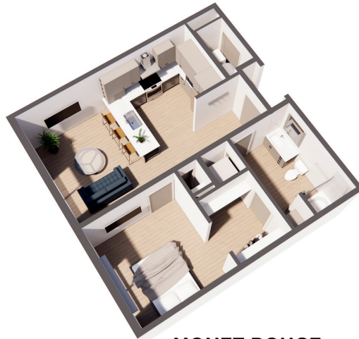
MONET ROUGE 1 BED X 1 BATH 668-678 SF