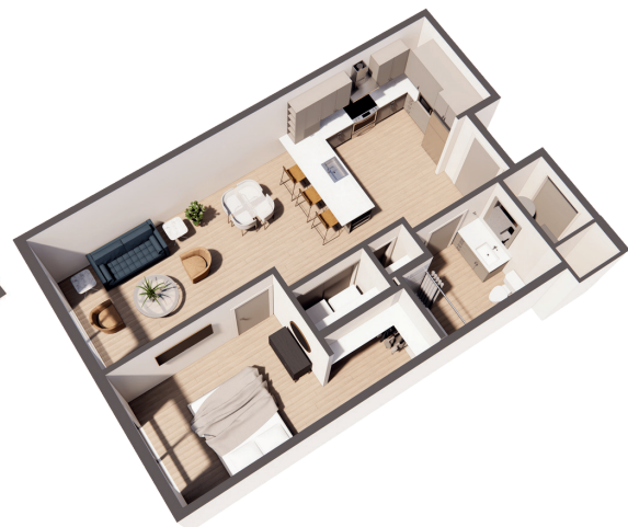
MONET JUENE 1 BED X 1 BATH 729-739 SF