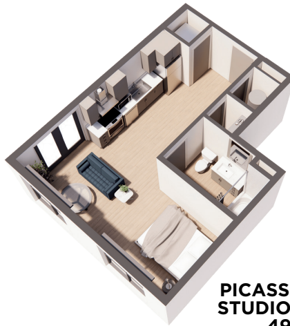
PICASSO ROUGE STUDIO X 1 BATH 496 SF