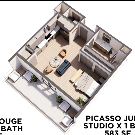
PICASSO JUENE STUDIO X 1 BATH 583 SF