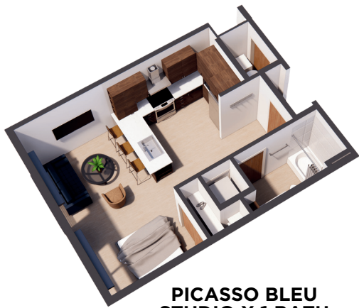
PICASSO BLEU STUDIO X 1 BATH 496-512 SF