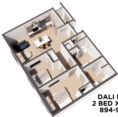
DALI ROUGE 2 BED X 2 BATH 894-907 SF